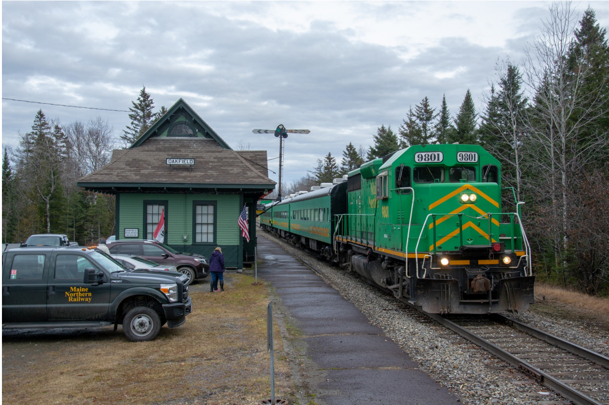
Maine Northern's Santa Train calls on Oakfield Station – 11-22-15

As of this writing, a new generation of directors is currently working to maintain the station. In recent years, the museum has hosted the Maine Northern Railway Christmas Trains. We open the station for the passengers to get warm. In May of 2014 the Maine Northern Railway donated a couple of passenger train excursion rides to raise money for the Museum, the first trains in 16 years to do so!