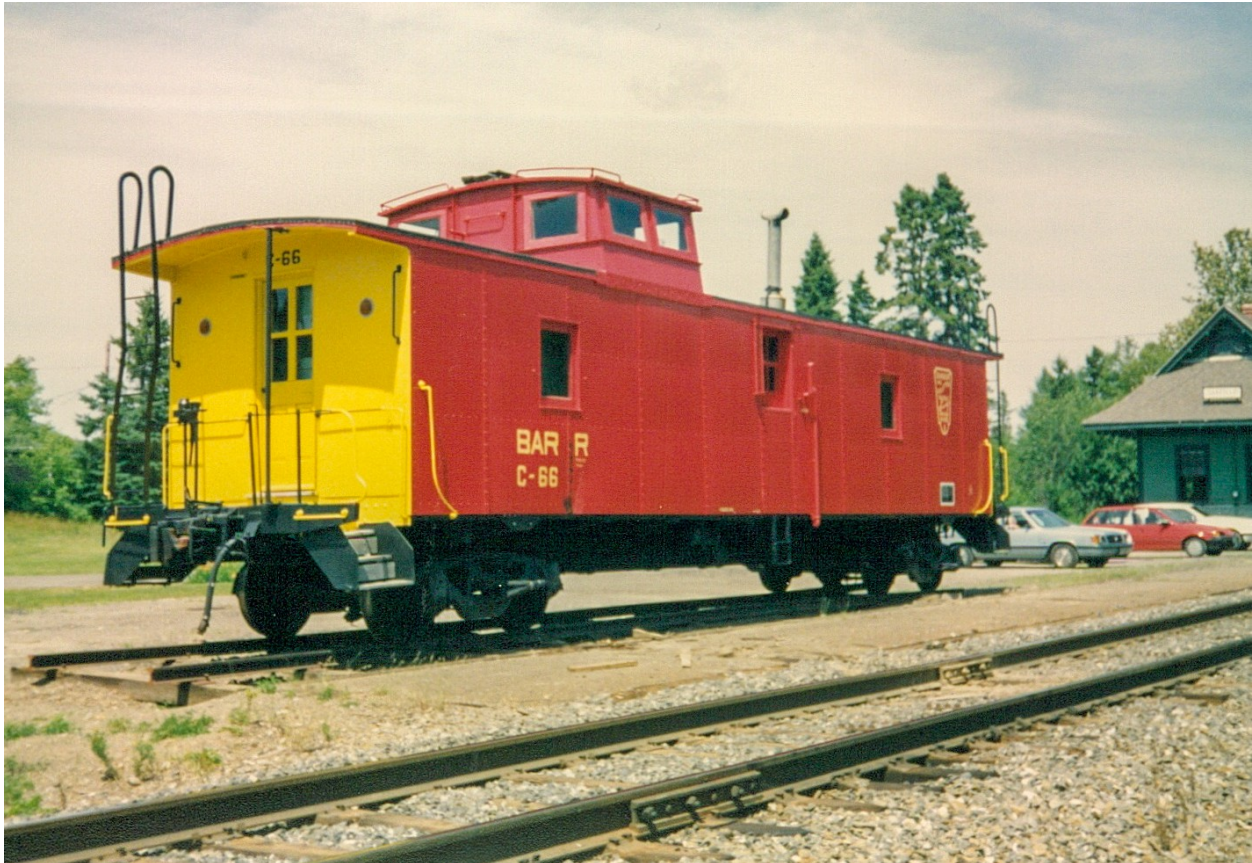
C 66 in Oakfield in 1992 not long after being donated.

Station that had been used as a parade float in 1991. Both were placed on land adjacent to the main line in Oakfield. This land was leased to the Oakfield Historical Society by the B&A and included the removal of the Oakfield piggyback ramp to make room.