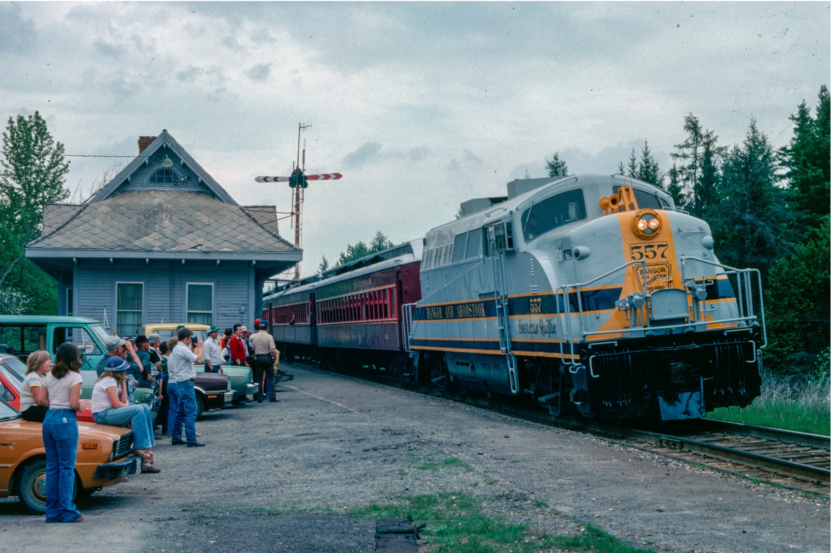
557 Poses by Oakfield Station on an excursion run. June 1, 1980.