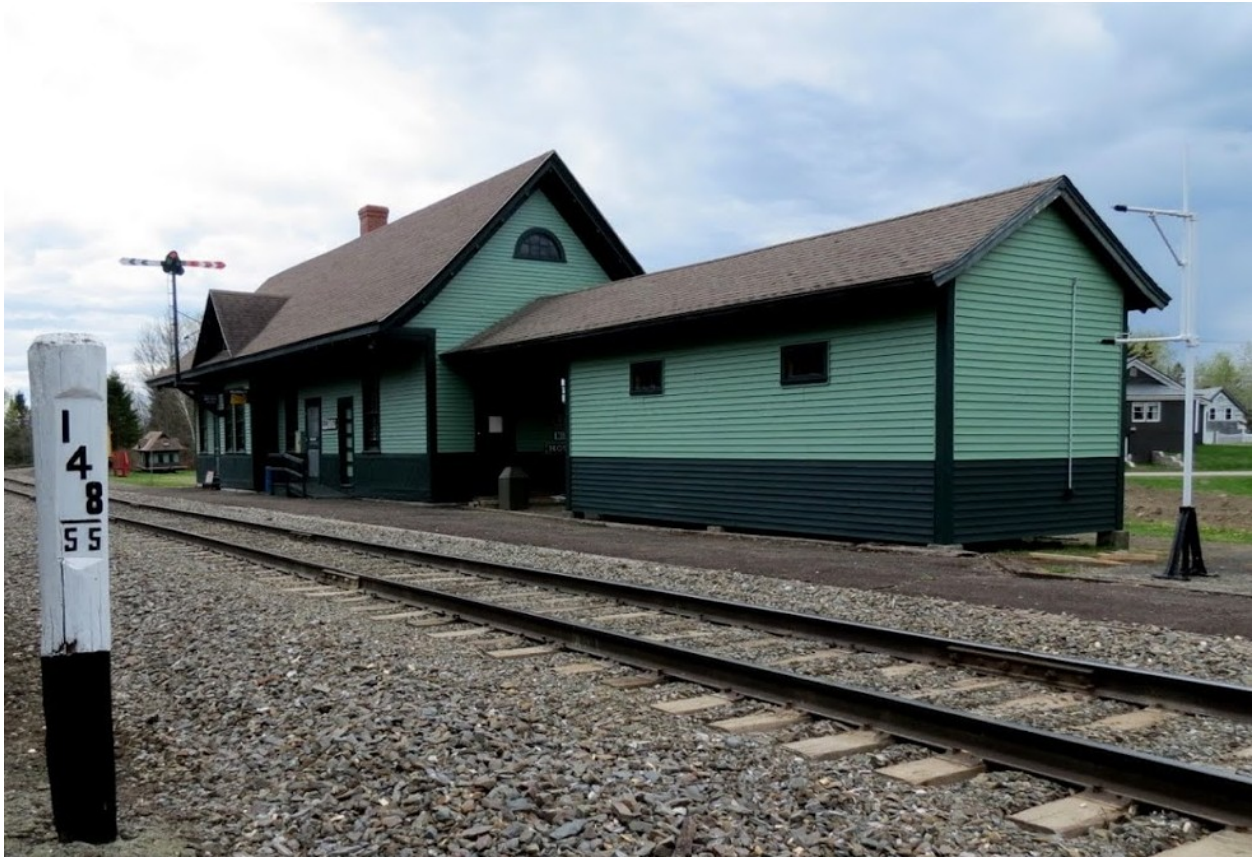
Oakfield Station as it appears today