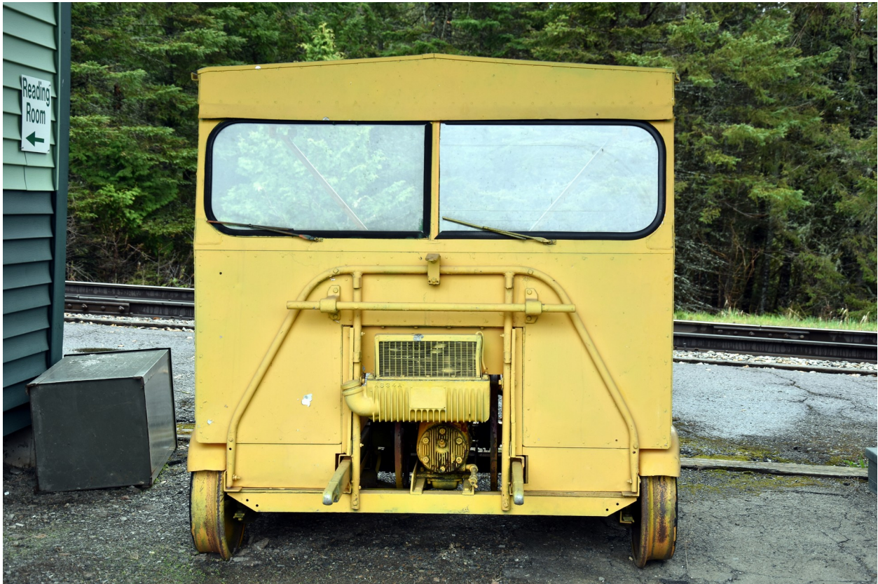
B&A 67, Oakfield Railroad Museum, May 20, 2018