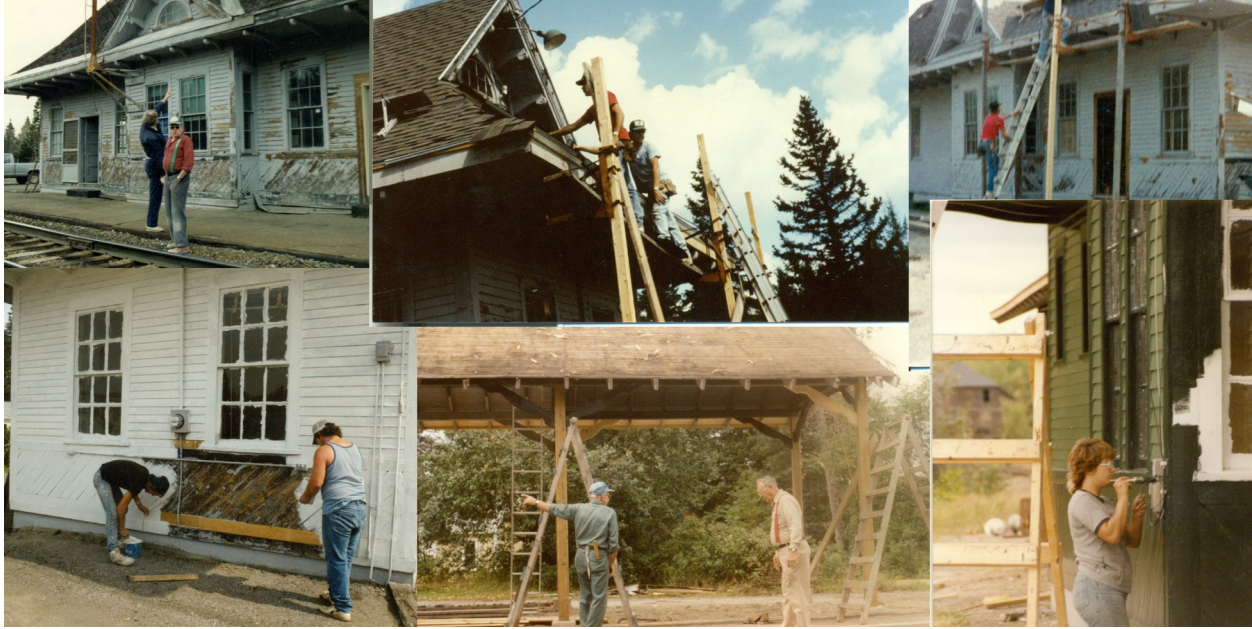
Volunteers Get it done! Station Restoration photos from the collection of the Oakfield Historical Society