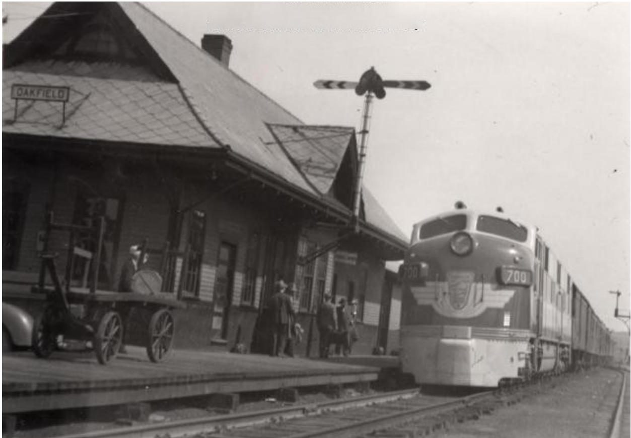
1950s Passenger train at Oakfield Station

Bangor and Aroostook passenger train service ended on September 4, 1961. Not long thereafter stations along the 239 miles of track from Bangor to Van Buren began to be dismantled and torn down. Passenger train stations in mid-1930's and 40's numbered approximately 31 along the many miles of rails that wound through villages and hamlets from Bangor's depot on the Penobscot River to Van Buren on the St. John River.